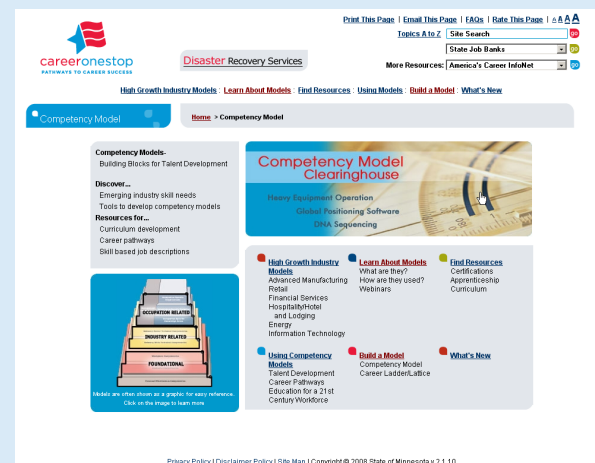
Read more on page 2.

The Competency Model Clearinghouse site within CareerOneStop has added two new interactive tools that can help.